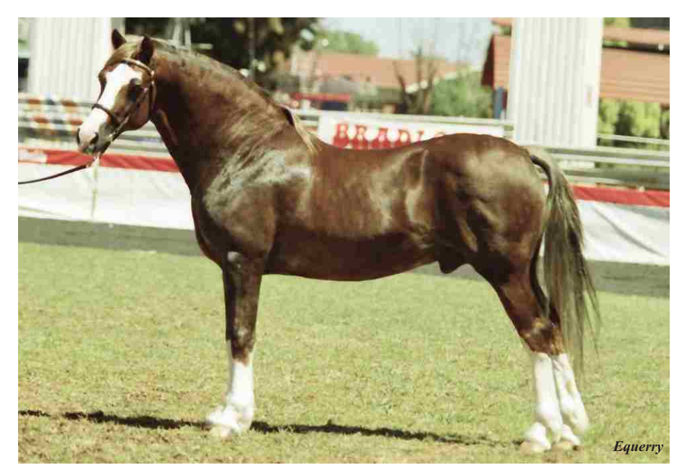
Kallista Russell – Section C/D Champion