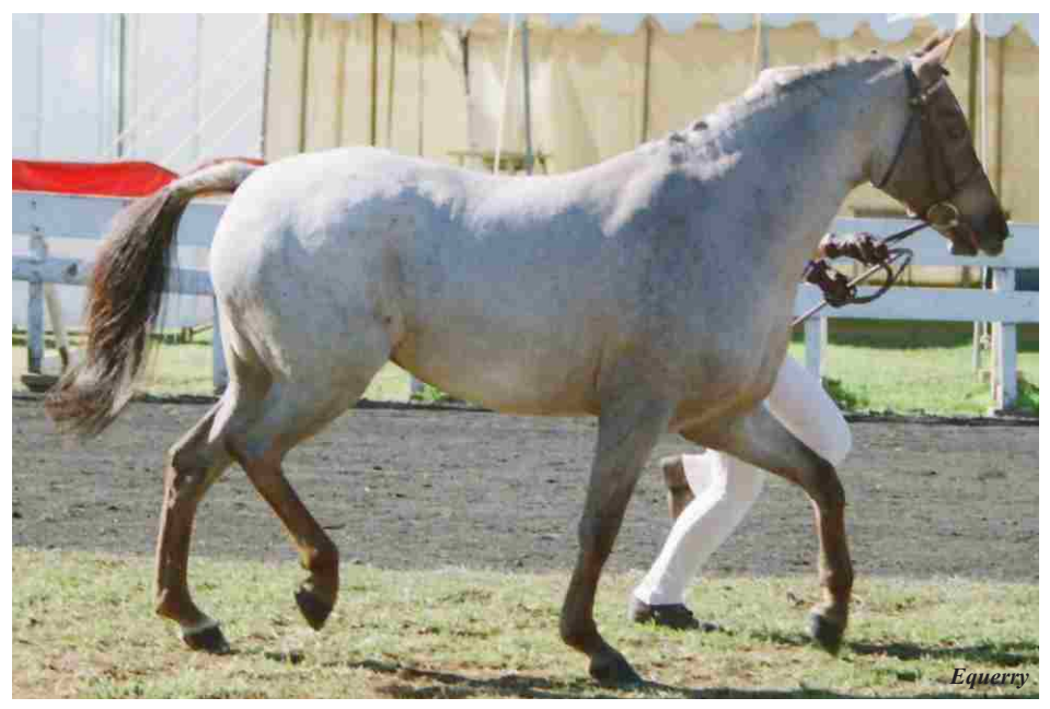
Caegwyn Dark Secret – Part Bred Champion