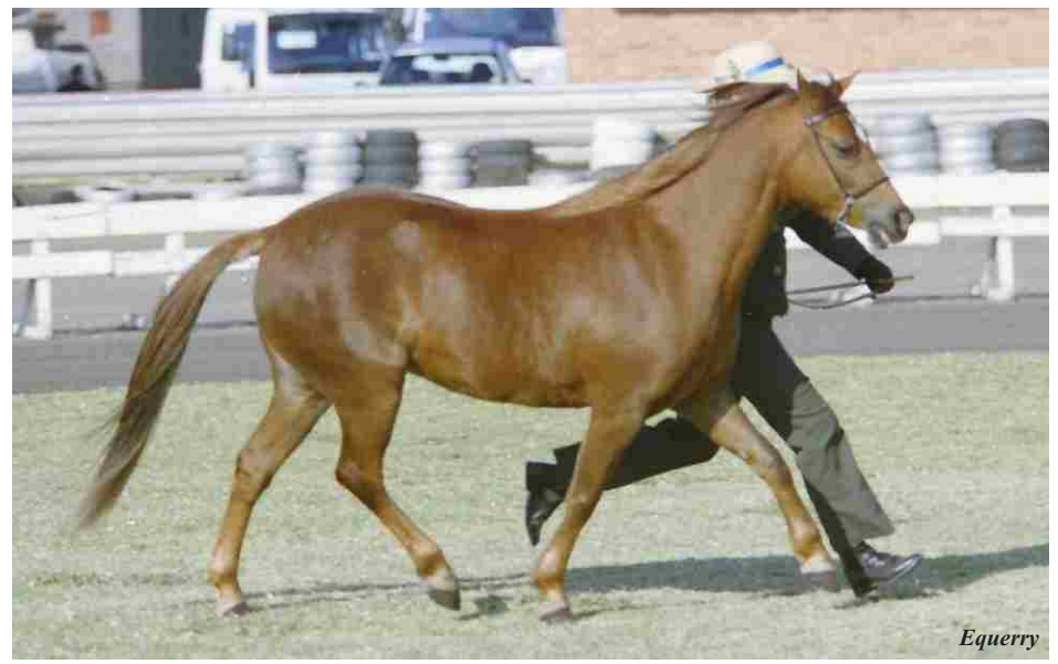
Rhys Gwillian – Section B Champion