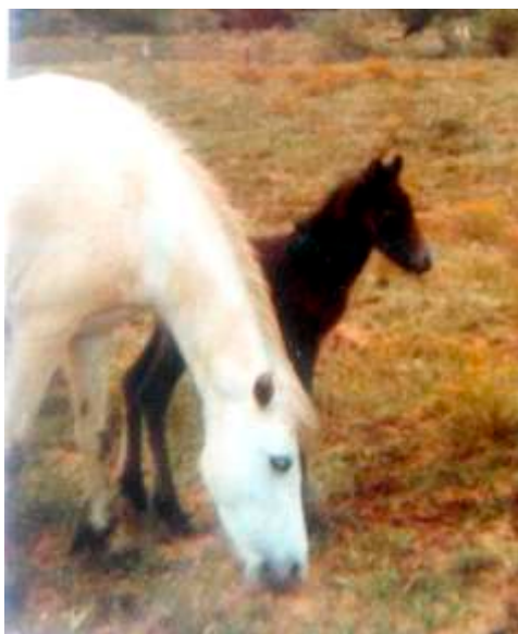
Aberdare Sepal and Font Senorita