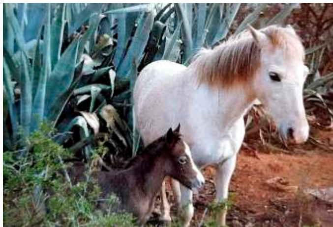
Aberdare Dozy and Font Woodpecker