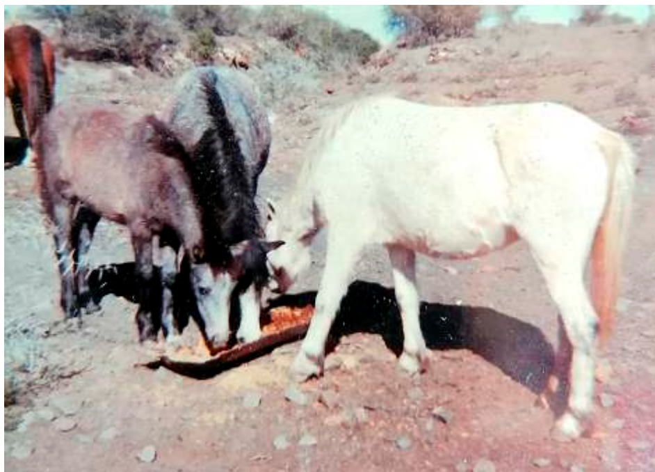
Ponies in the drought – Font Senorita, Aberdare Nicholas and Aberdare Dozzy

The last Partbred Welsh was by Aberdare Nicholas out of Aberdare Dozzy who produced Font Nicole.