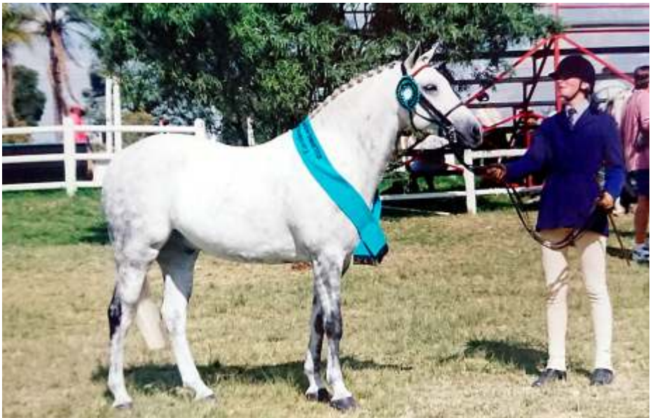
Waterside Ready Token