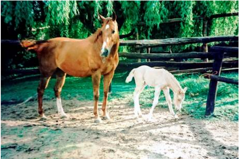
Dorset County with foal Brylia Cotton Club