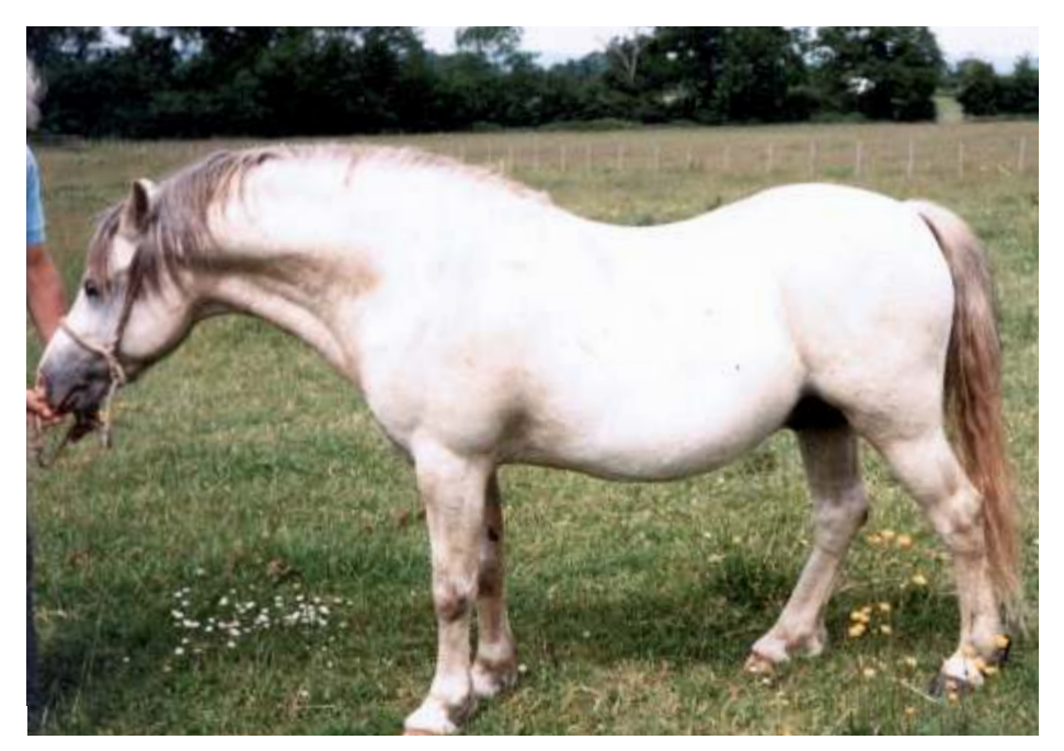
In June 1985 immediately before being exported to South Africa