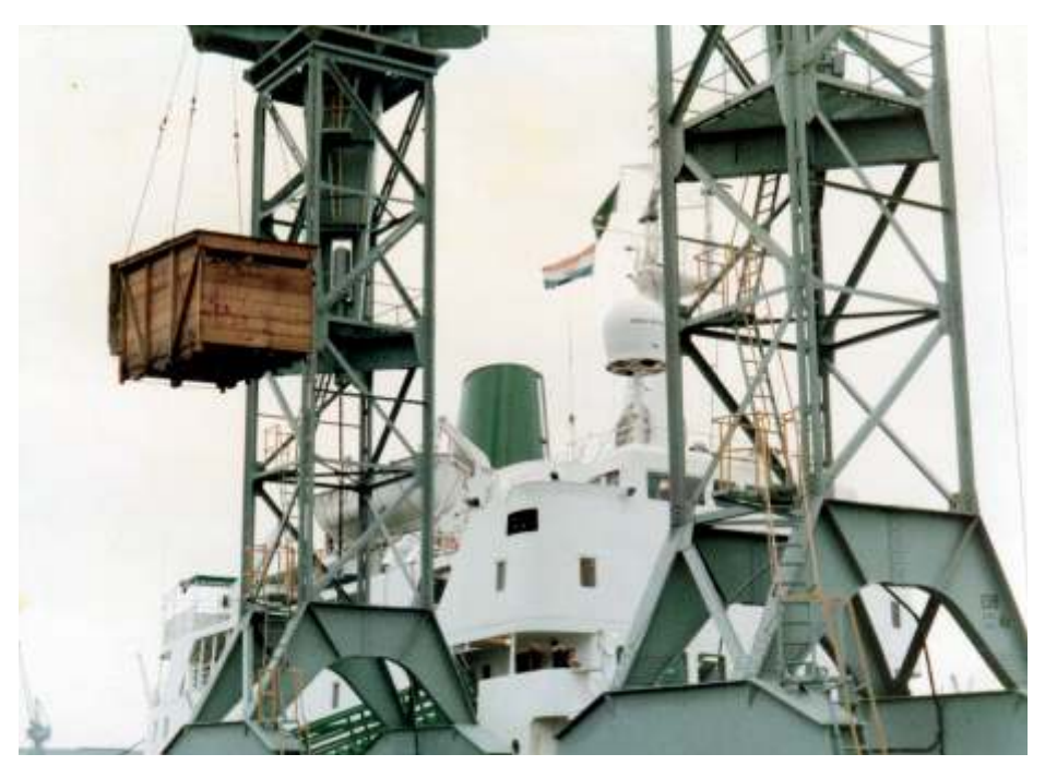
Rabelais being unloaded at the docks. His nose is barely visible