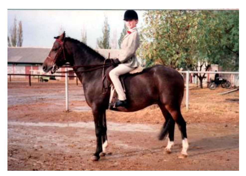
Hydown Brimfull at Bloemfontein