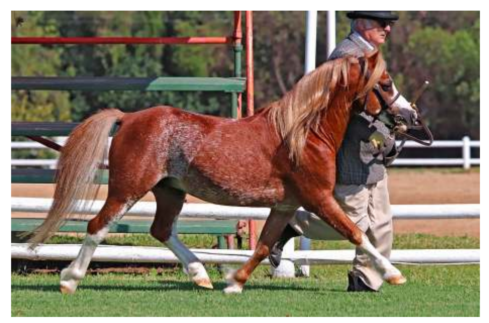
Plasderw The Minstrel