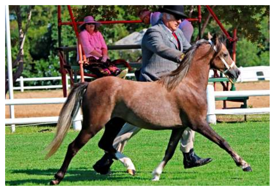
Tipuana Floral Bouquet