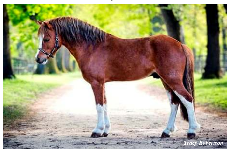
Nerwyn Gwyl y Banc