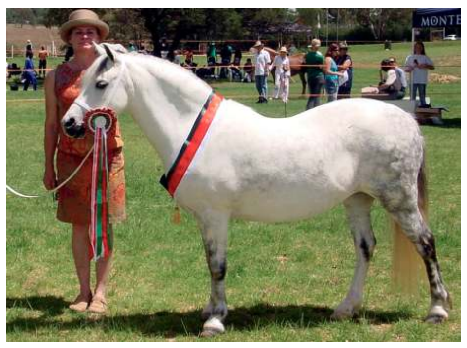
Llandilo Foxy Lady

In 2000 we arranged a truck to evacuate a load of ponies from Zimbabwe following the land invasions, with the objective of repatriating Usnad Candy