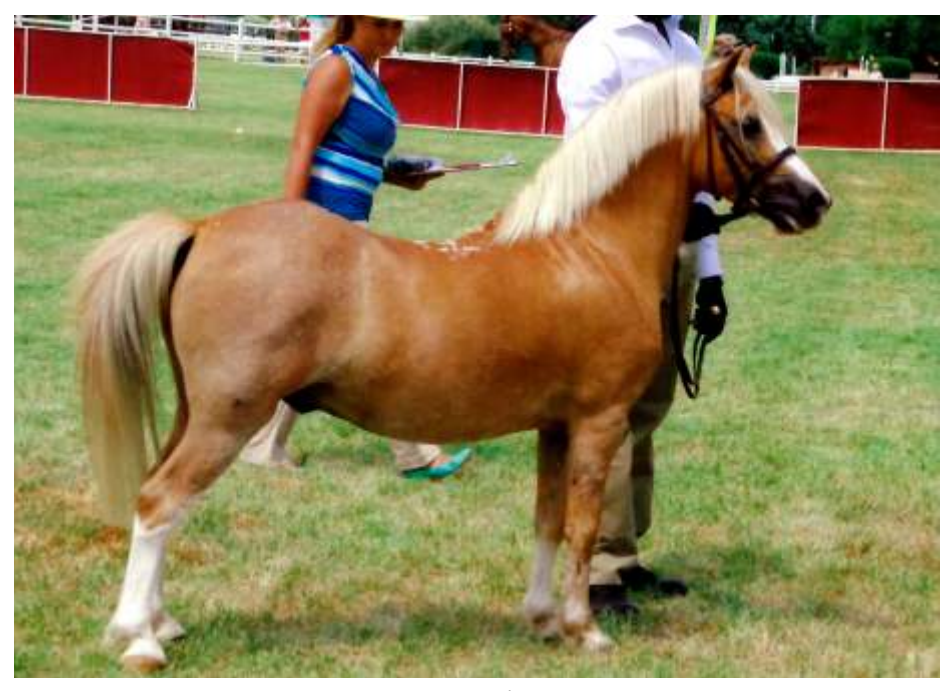
Tipuana Royal Cream