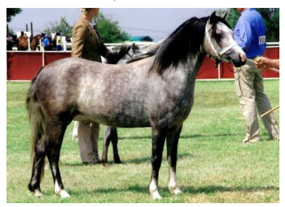
Tipuana Foxy's Charm