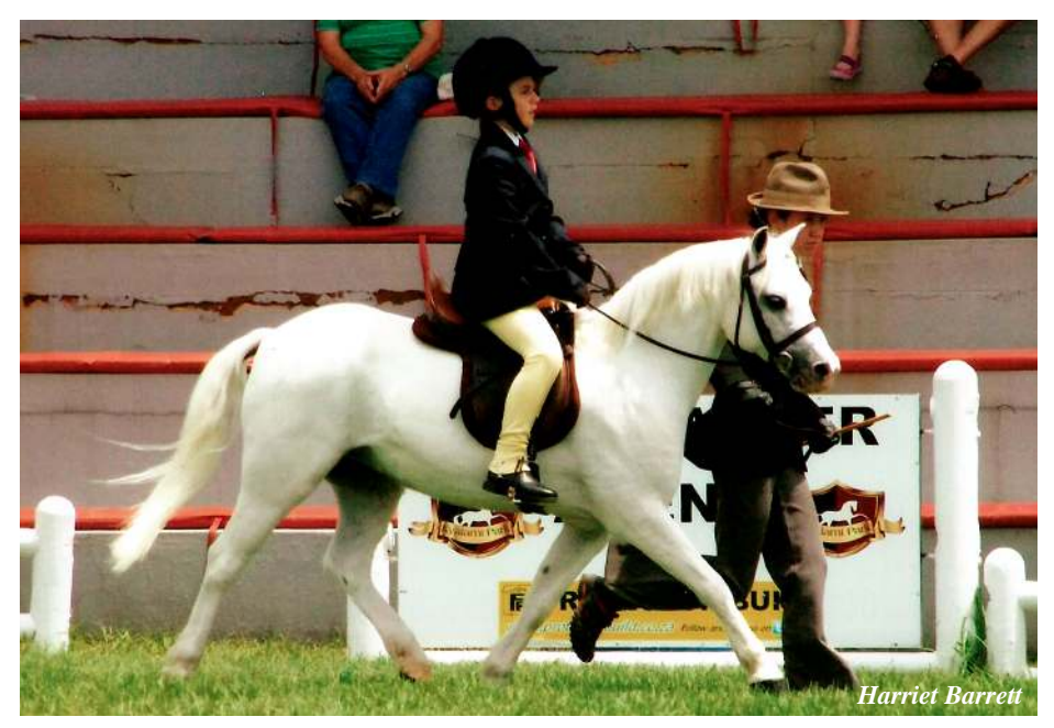
Tipuana Welsh Wizard