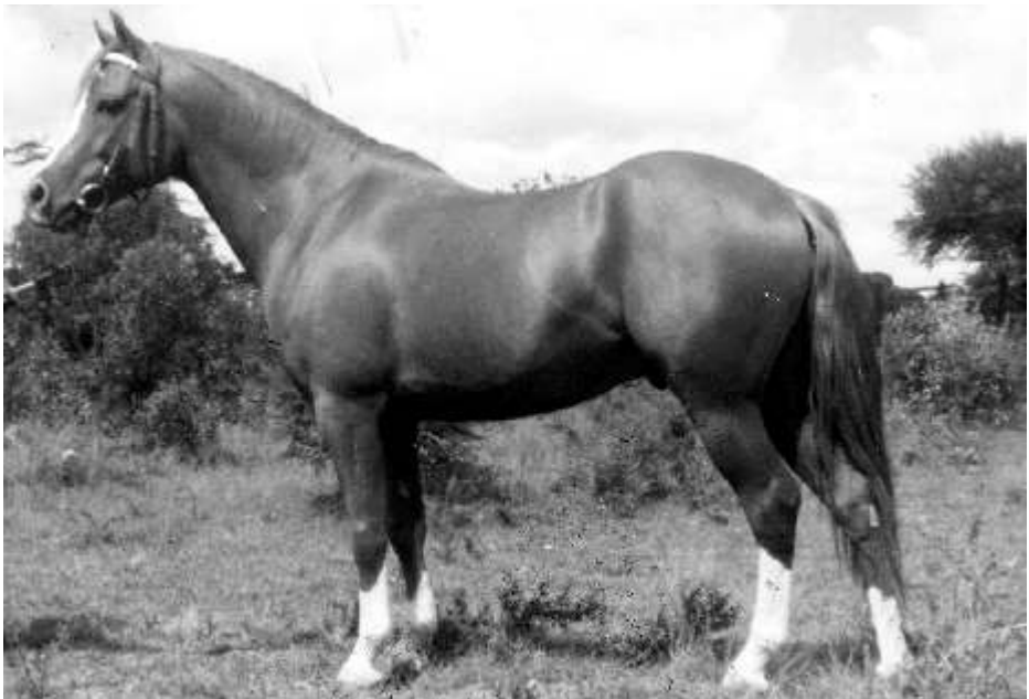
Torbry Tony, the last stud stallion of Wrekin Stud in 1978